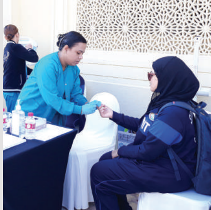
Zulekha Hospital set up a medical camp at the Sharjah Ladies Club in February 2018.