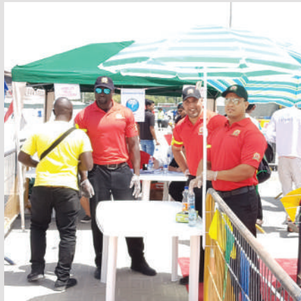
Zulekha Hospital's Nurses conducted a first aid training camp at Transguard Group in March 2018.