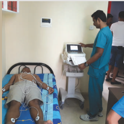
Zulekha Hospital organised an ECG camp in April 2018 for the employees of Megarme Company.