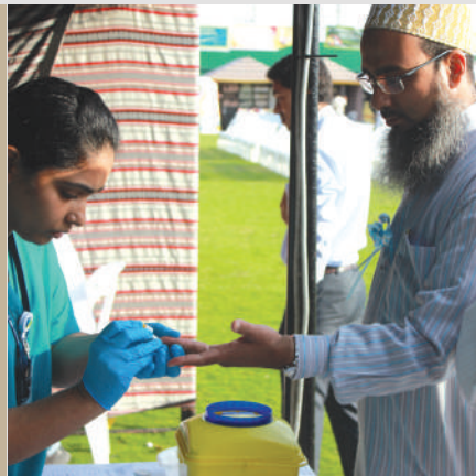
Zulekha Hospital organised a medical camp for the Bohra Community in January 2018.