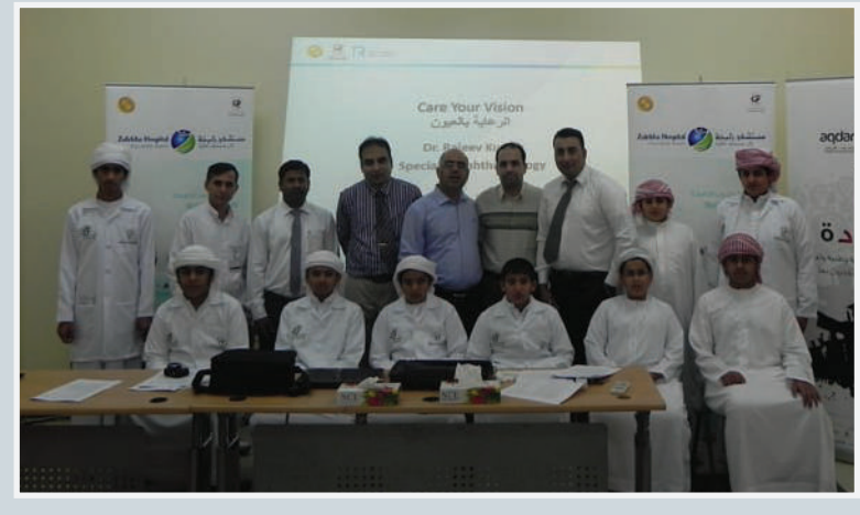
Basic eye checkup at Al Weshah School, Dhaid