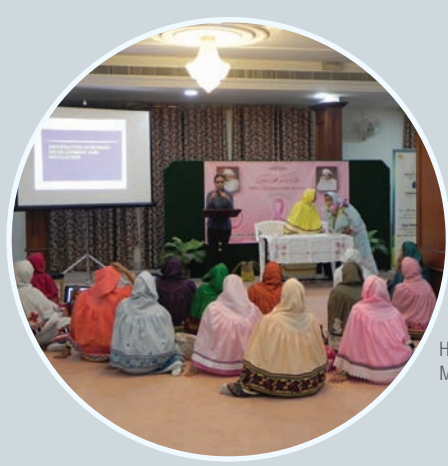
Health Talk at Bohra Community Mosque, Ajman