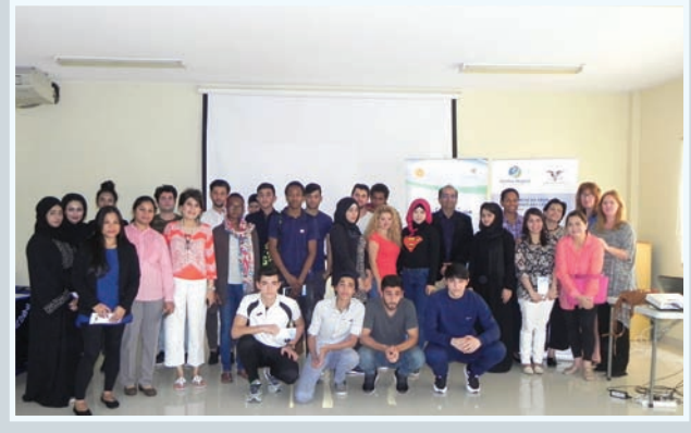
Lasik Awareness Session at American College of Dubai