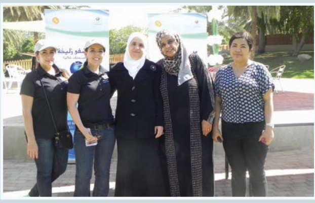
Health Awareness Session at Sharjah Investment & Development Authority (Shurooq)