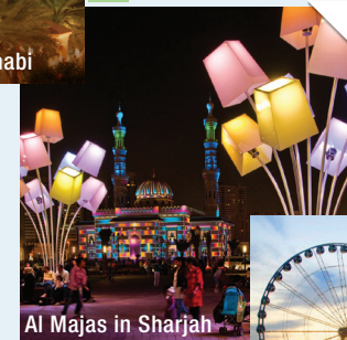
Al Majas in Sharjah