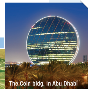
The Coin bldg. in Abu Dhabi